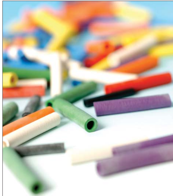
H rubber tubing is highly flexible and easy to apply.

To save time and effort when fitting the tubing, try the HellermannTyton K, S and SS three prong tools (see Chapter 6.3) and the Hellenine lubricant (see Chapter 2.3), which are specially designed for use with HellermannTyton chloroprene tubing.