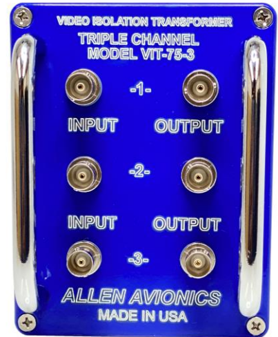
90-6316 ALLEN AVIONICS VIT-75 ANALOGUE VIDEO ISOLATION TRANSFORMER 1 channel 90-6317 ALLEN AVIONICS VIT-75-3 ANALOGUE VIDEO ISOLATION TRANSFORMER 3 channel

Breaking the ground connection in video transmission lines will eliminate 50Hz - 60Hz hum caused by ground loops. When there are hum problems caused by large potential differences, (20 volts or more), the VIT is the product to use. The dielectric with standing voltage of the VIT of over 500 volts at DC. VITs are true isolation transformers—there is no DC path between the windings. Frequency response is flat over the range 20Hz. to 4.5MHz. VITs also remove the hum created by electromagnetically induced currents from power lines or distribution systems.